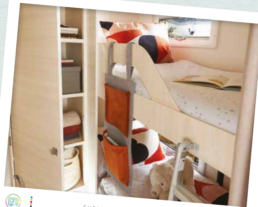
EVOLUTION 496PE KID'S