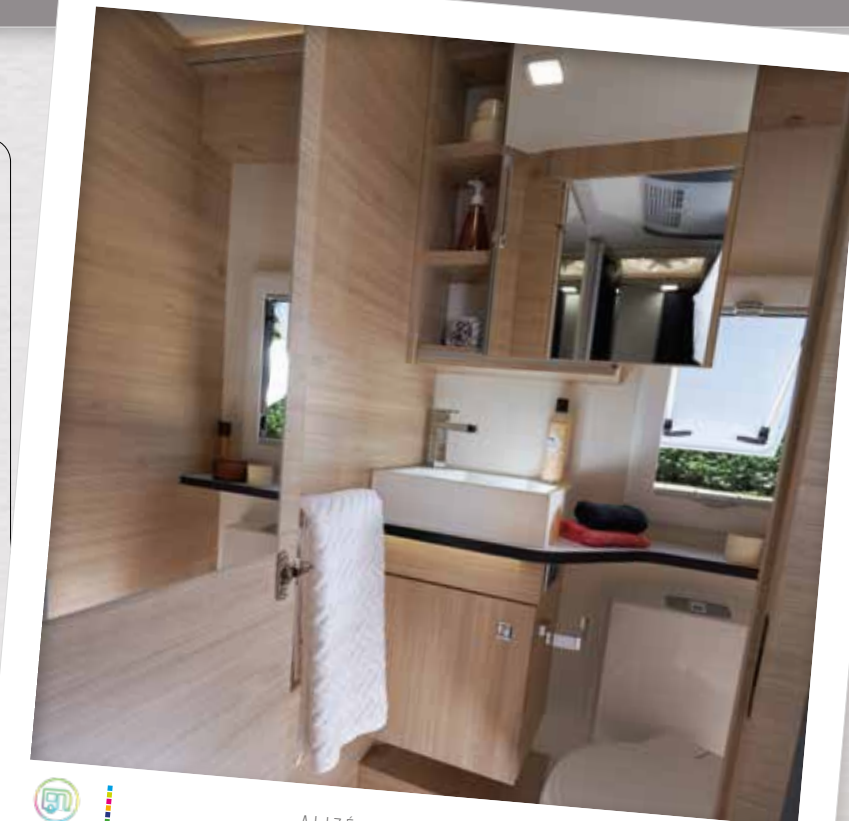
ALIZÉ CONNECT 560CP