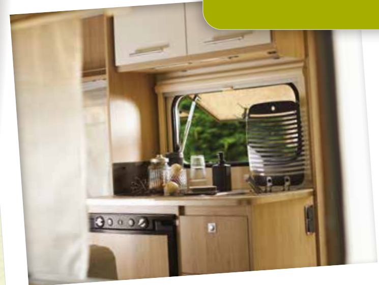
EASY 390 CP