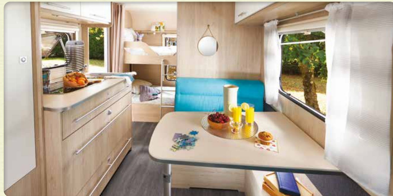
EASY 470 PE