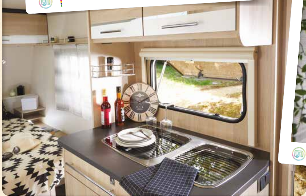
STARLETT COMFORT 480CP