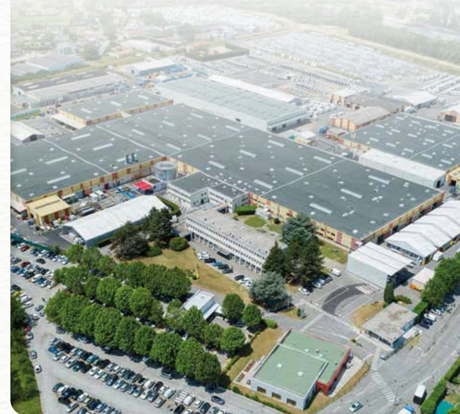
TOURNON SUR RHONE, ARDÈCHE, FRANCE.