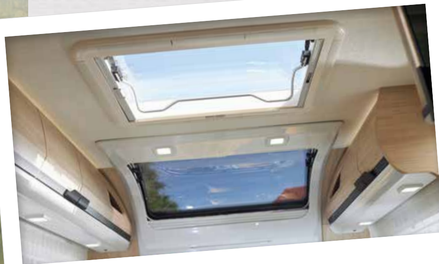
ALIZÉ CONNECT 560CP