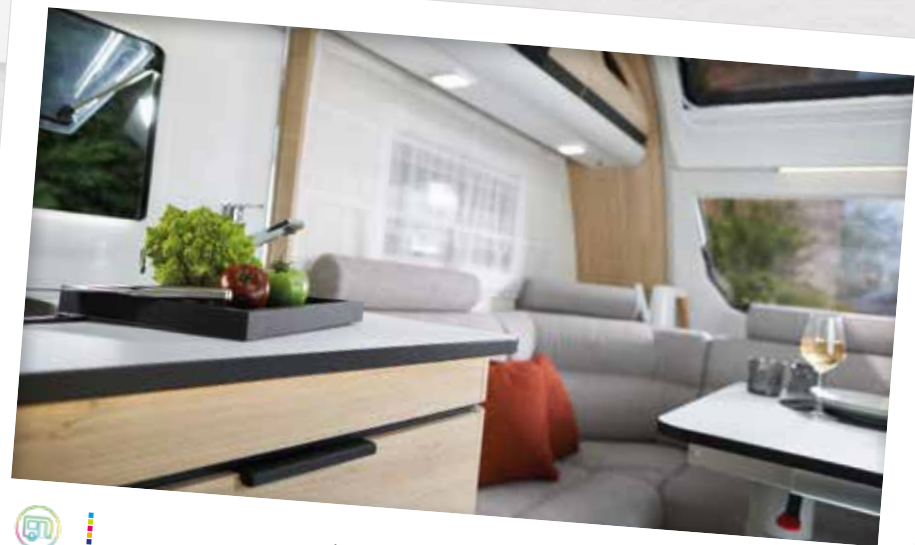
ALIZÉ CONNECT 560CP