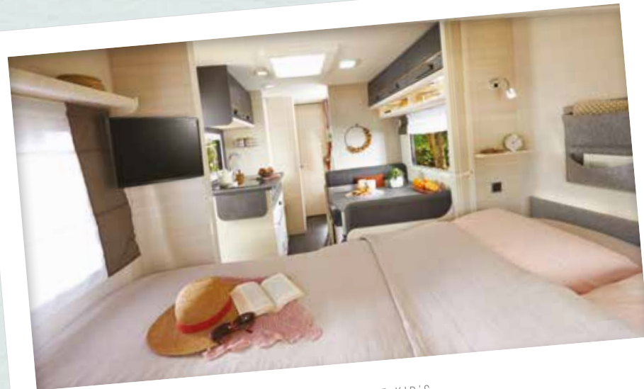
EVOLUTION 496PE KID'S