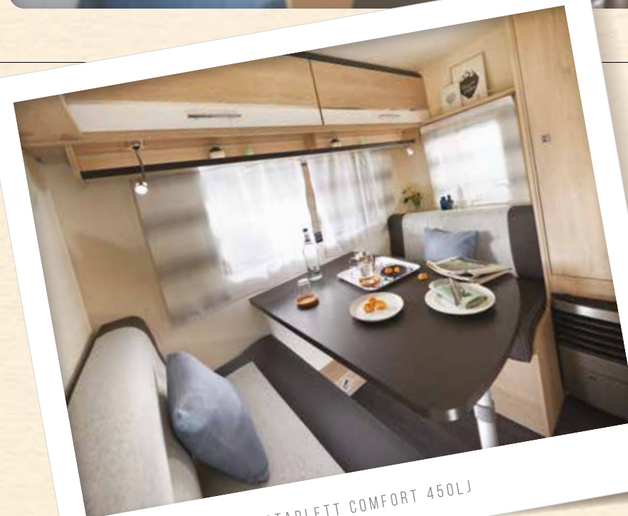
STARLETT COMFORT 450LJ