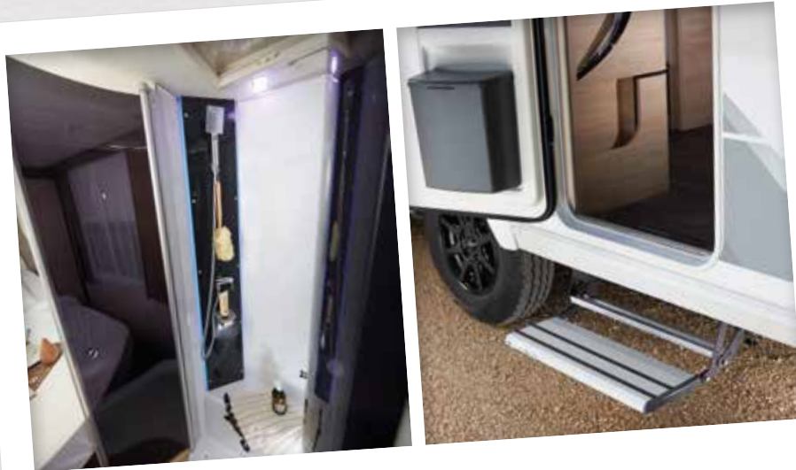
ALIZÉ CONNECT 560CP