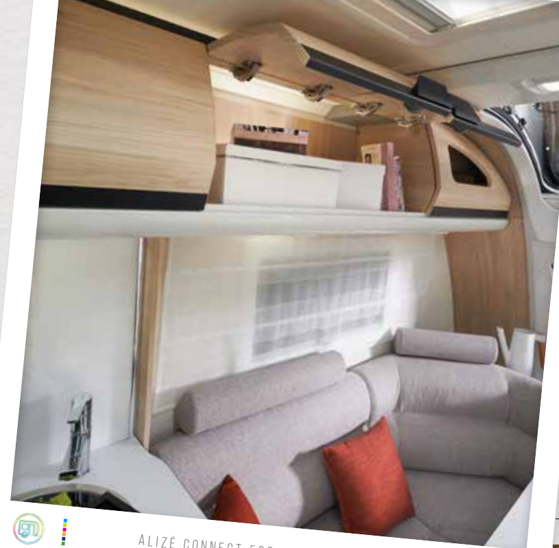
ALIZÉ CONNECT 560CP