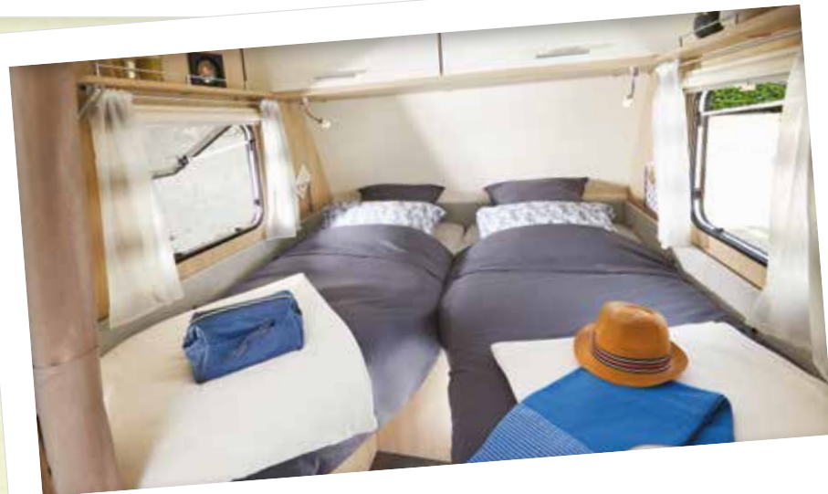
EASY 470 LJ