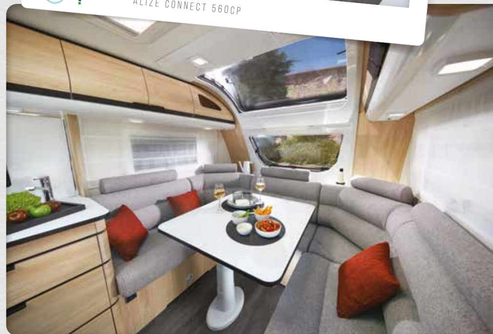
ALIZÉ CONNECT 560CP