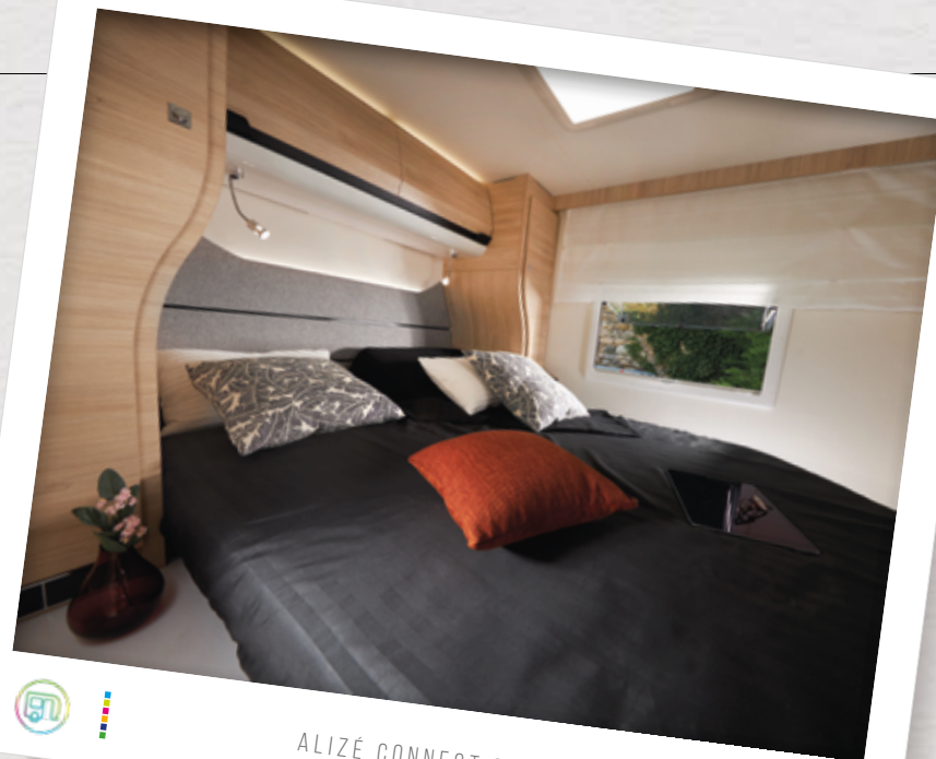
ALIZÉ CONNECT 560CP