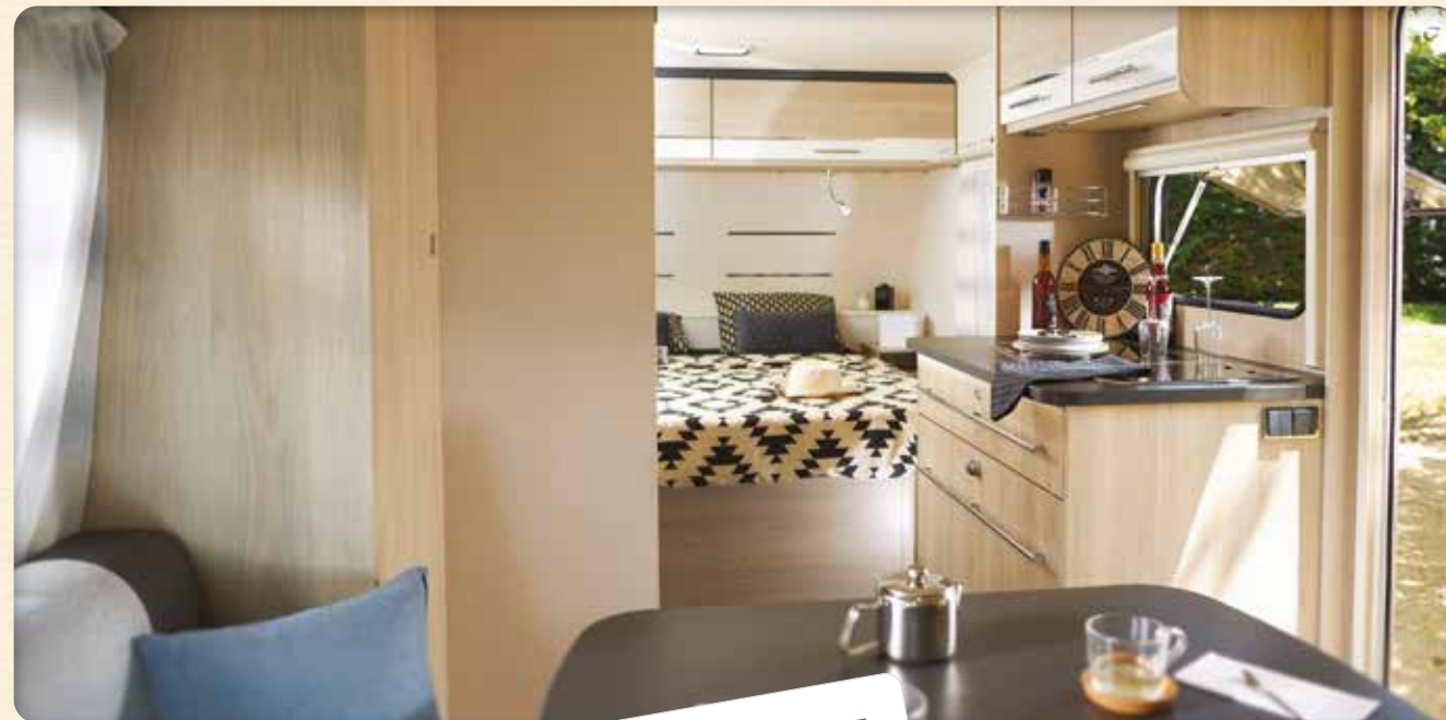
STARLETT COMFORT 480CP