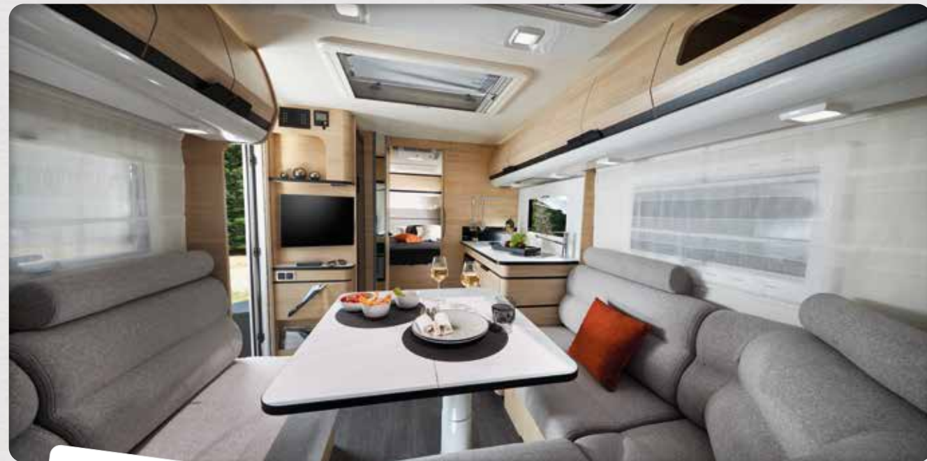
ALIZÉ CONNECT 560CP