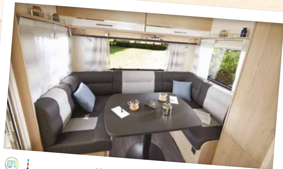
STARLETT COMFORT 480CP