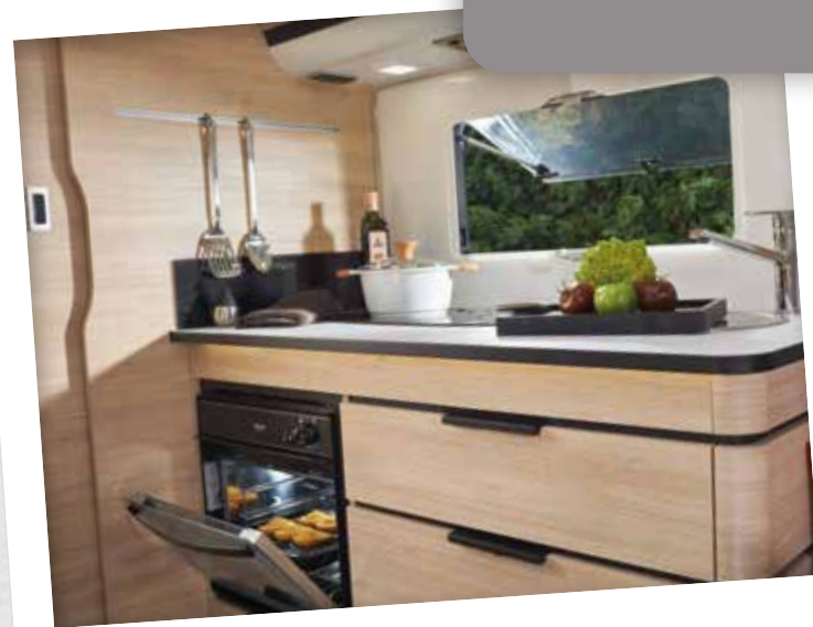
ALIZÉ CONNECT 560CP