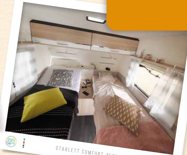
STARLETT COMFORT 450LJ