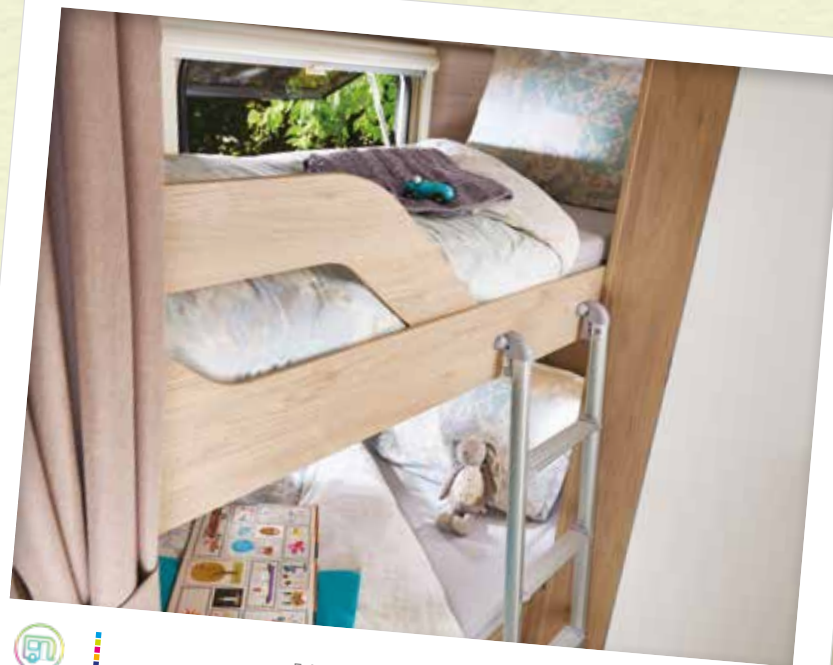
EASY 470 PE KID'S